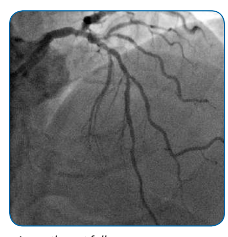
4 month post follow up