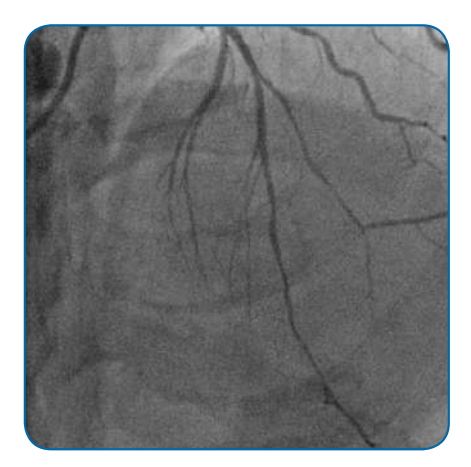
LAD Post-Laser, pre balloon