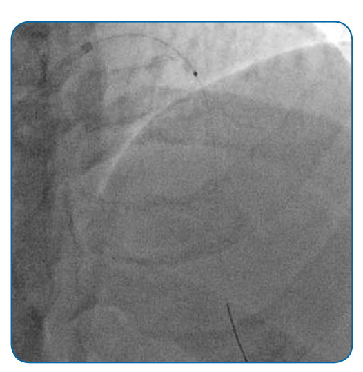
LAD with 0.9mm X 80 Laser